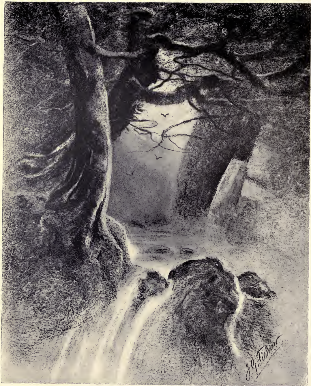
THE MOUNTAIN TORRENT.